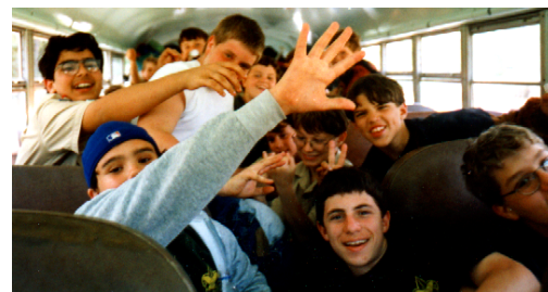
After a long camping trip, getting ready for the calm bus ride back home.

"All patrols did well, but I must say I was impressed with the Wolverine Patrol on their first campout. I observed their teamwork in preparing their meals, cleanup, and keeping their campsite neat throughout the trip. This patrol looks like they're going to be winners, and I'm looking forward to future campouts watching them put into action the many new camping skills they will be learning."