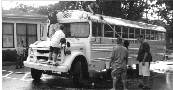
Scouts wash the troop bus on June 7 before camp.

This summer, Troop 888 returned to Camp Bob Hardin in Saluda, NC. This is a beautiful Scout camp, and a great place to get the legs in shape, for there are hills everywhere, and you can't help but do a lot of climbing during a week-long stay. In addition to daily advancement sessions for Tenderfoot, Second Class and First Class ranks, the following merit badges were earned by troop members: