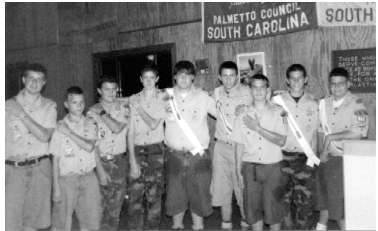
Newly tapped out candidates for the Order of the Arrow standing next to O.A. members present from our Troop.

On a rainy Wednesday night, June 16, five members of Troop 888 were "grabbed" away from the audience during an Order of the Arrow